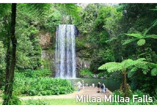
Millaa Millaa Falls