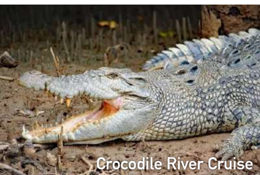
Crocodile River Cruise