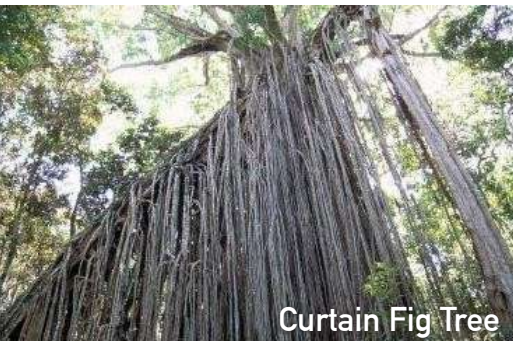
Curtain Fig Tree